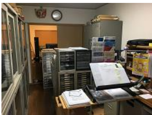
Design & Development Office